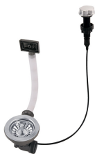
automatic waste fitting 8407 000