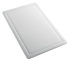
hpdce chopping board 8657 001