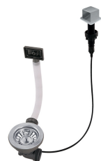
lira automatic waste fitting 8407 103