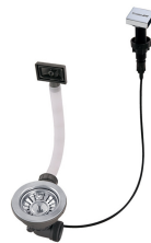
lira automatic waste fitting 8407 102