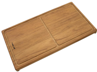
iroko-wood sliding chopping board 8643 000