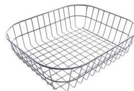
stainless steel basket 8611 000